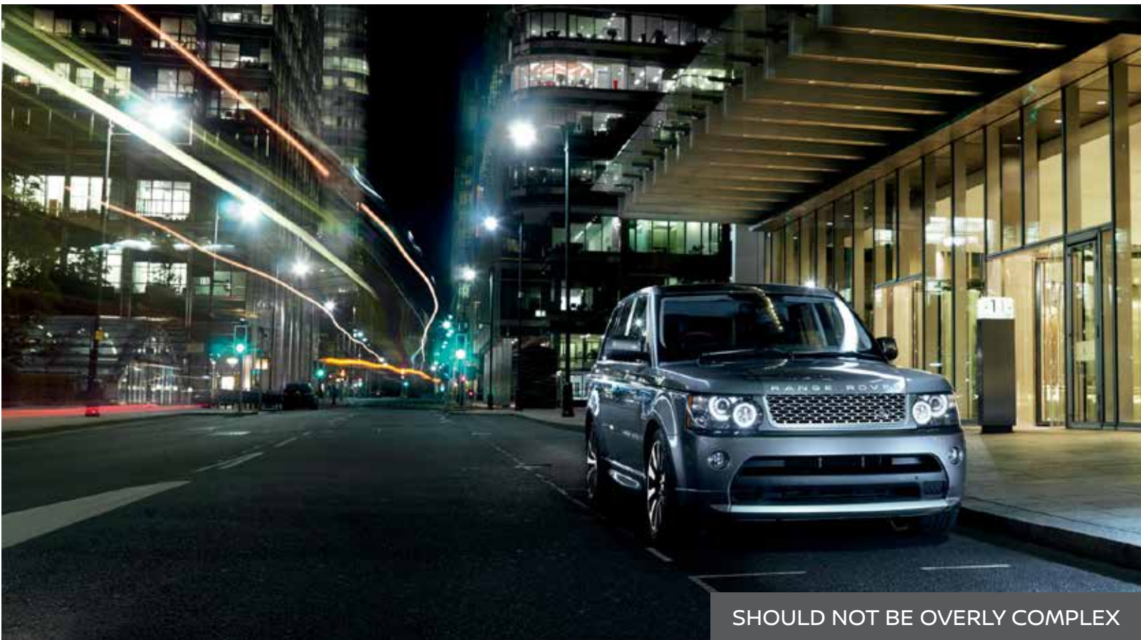
SHOULD NOT BE OVERLY COMPLEX