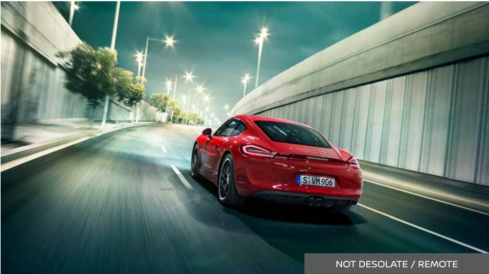
NOT DESOLATE / REMOTE