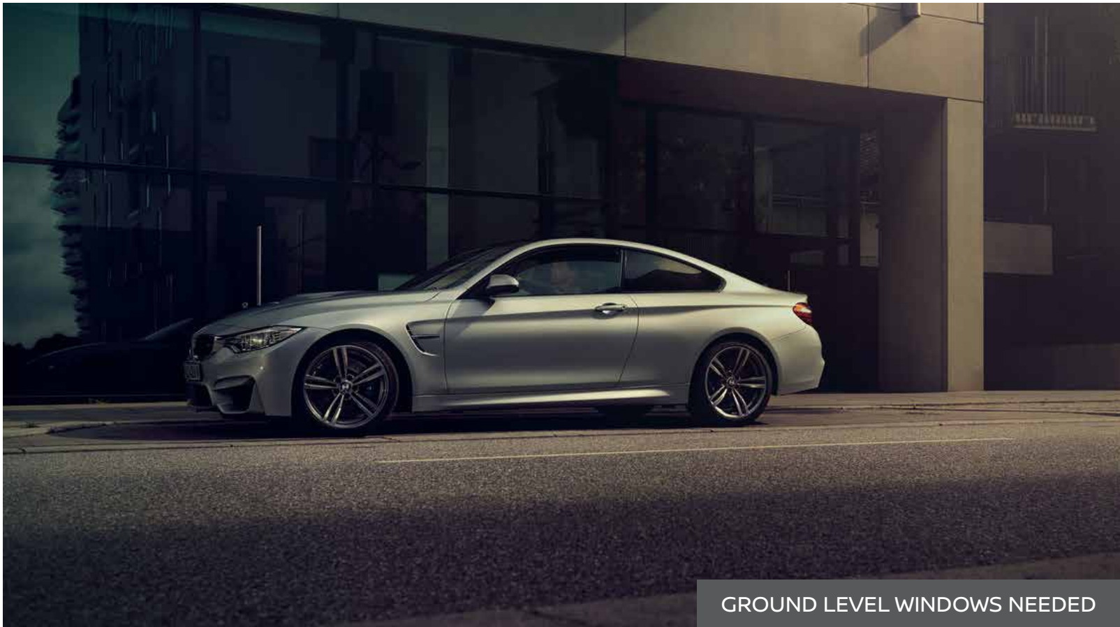
GROUND LEVEL WINDOWS NEEDED