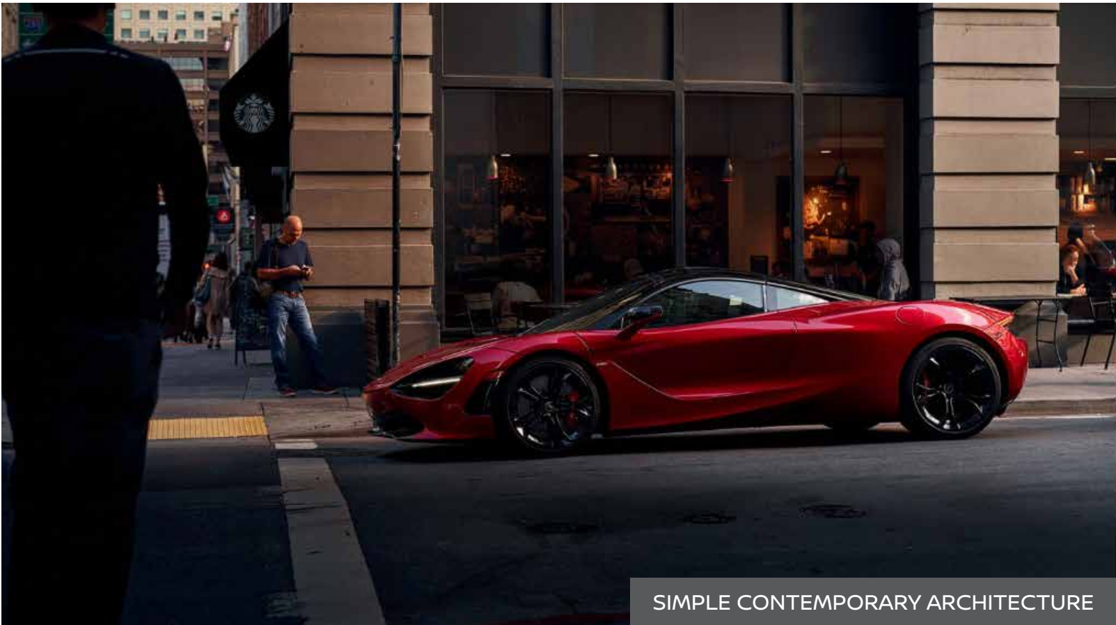
SIMPLE CONTEMPORARY ARCHITECTURE