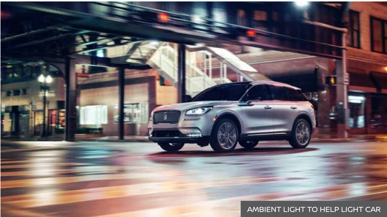
AMBIENT LIGHT TO HELP LIGHT CAR